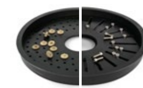
Custom Made upon request