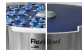
Quick Emptying for fast product changeovers