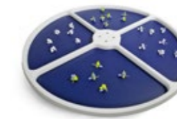
For Multiple Parts feeding